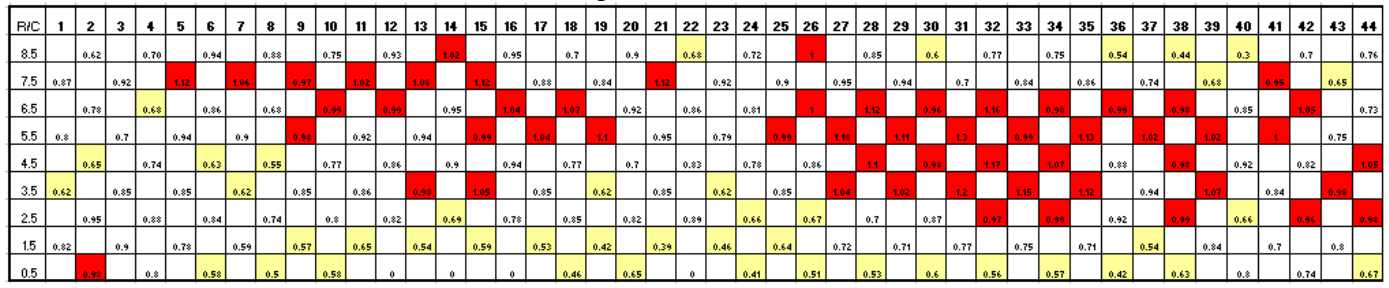
Table 2 GD test report from manual measurement